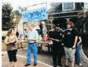
Patrons enjoying the food and music