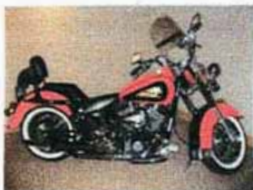
Indian Motorcycle ca 1990's

Our major sponsor for this event was Competition Sports, the Suzuki dealership in Harlingen. Honda and Bicycle World exhibited several mod-