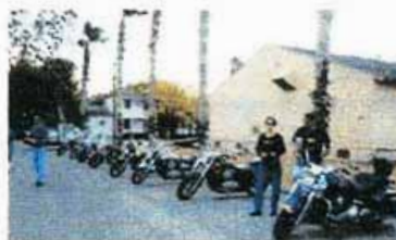
Parking Lot "exhibit"